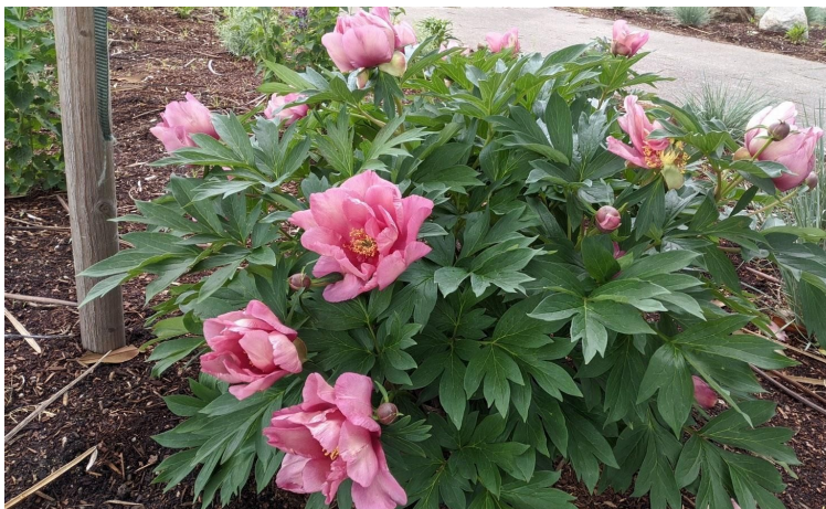
Pollinator Garden Installation, area 3