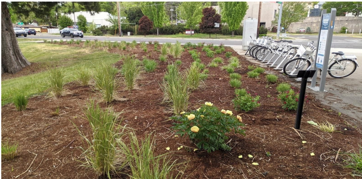
Pollinator Garden Installation, area 1