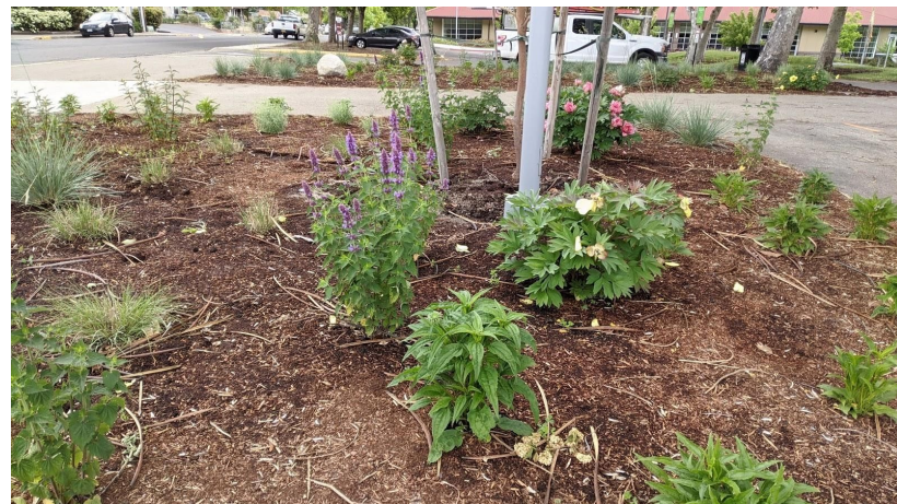
Pollinator Garden Installation, area 3