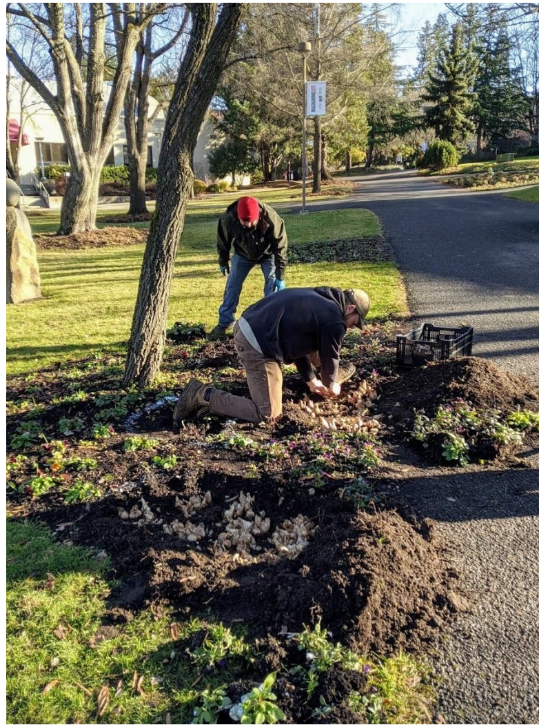
Daffodil plantings, part of a larger pollinator conversion after a lawn removal

Arbor Day Celebration 4/19/2019. 100+ participants: installed 25 flowering trees, rehabilitated pollinator gardens in low-traffic areas.