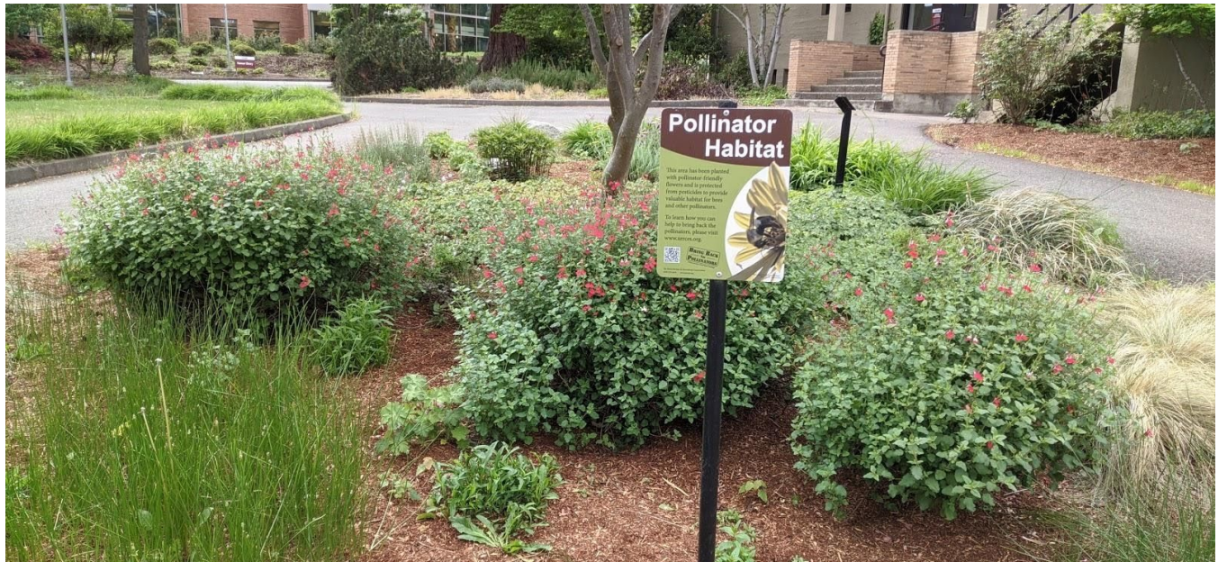
SOU loves bees!!!

Pollinator habitat sign on new garden, permanent.